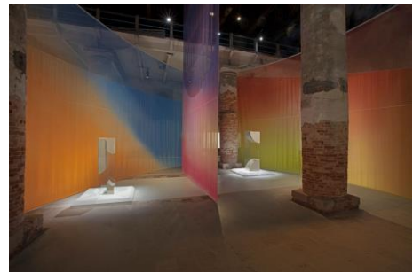
Kapwani Kiwanga, Terrarium (2022)