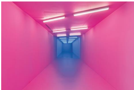
Kapwani Kiwanga, pink-blue (2017)

The artist searches for a vocabulary to look at existing structures and power relations from new perspectives in order to think about them differently in the future. The visually impressive works initially appeal to the viewer in a very sensual way. At second glance, the historical-political dimensions of her works reveal themselves, some of which surprise and unsettle. Glass, two-way mirrors, shade cloth, stone, sand, sisal, and plants, as well as light and color—for Kapwani Kiwanga, these are not value-neutral materials, but rather materials charged with content. Their choice is never purely aesthetic. Rather, she translates social, geological, ecological, historical, and diasporic themes into powerful artistic statements. She stages material histories in which the material is at once ambassador, metaphor, bearer of experience, and socio-political instrument. In this way, she shakes the foundations of our cultural socialization. She refines our sense for “hidden” social mechanisms, structural injustices, as well as global and everyday power asymmetries.